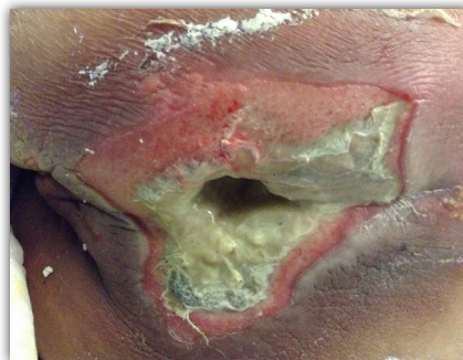
Figure 3: Standard Imaging Mode ™