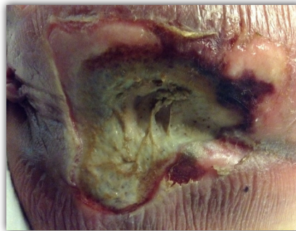
Figure 1: Standard Imaging Mode ™

63-year-old lymphoma patient’s large, untreated sacral pressure injury was discovered by the outpatient chemotherapy unit.