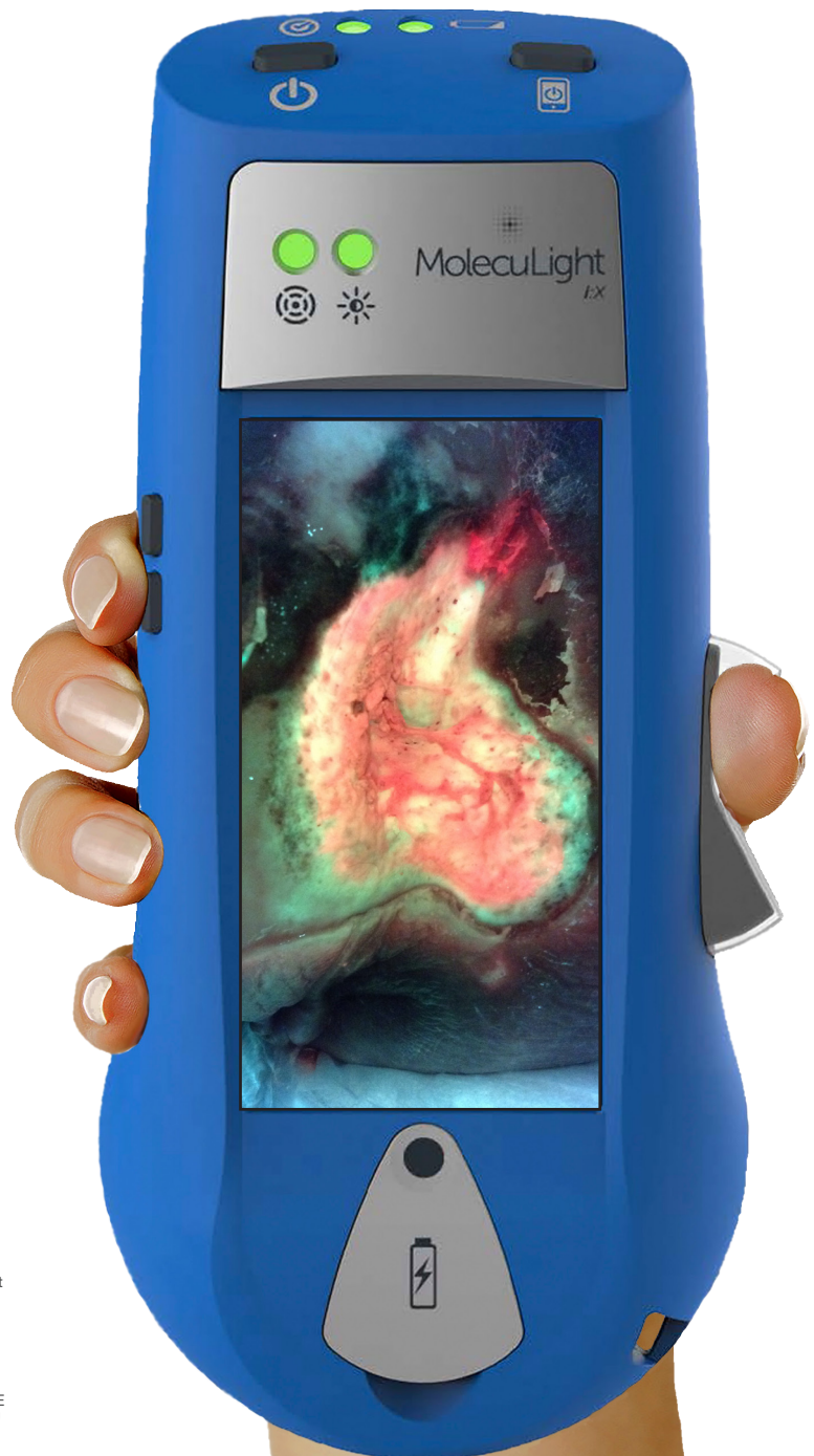
Bacteria appear red/blush pink in image

MolecuLight® and Look to Heal® are Registered Trademarks in Canada, the US, and the EU.