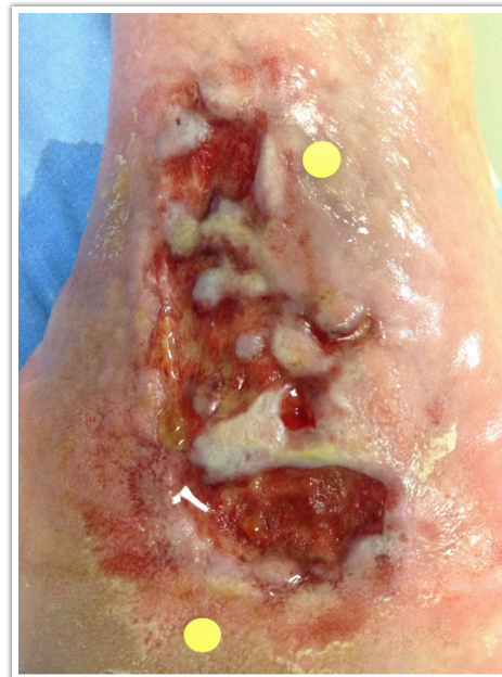
Figure 1: ST-image Mode.™ Image taken under standard lighting conditions with two MolecuLight WoundStickers.

Due to this patient's irregular wound borders, standard wound ruler measurements overestimated wound area by more than 2-fold (36 cm 2 with wound ruler vs. 15.85 cm 2 with the MolecuLight i:X (Figure 2)). By improving wound measurement technique, the clinician was better able to gauge patient response to chosen interventions.